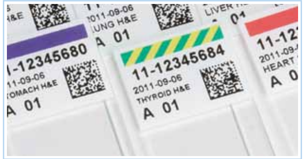
Printing only the slides you need, when and where you need them, helps avoid potentially serious patient safety errors.

Signature is designed for efficient, hands-free operation. Slides are stored in easy-to-load cartridges – away from dust and other potential contaminants. It takes just a few seconds to change out the cartridge if you need standard slides for one study and charged slides for others. The level of slides remaining in a cartridge is easily viewed through the cassette's transparent blue LED backlit case.