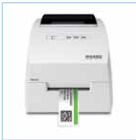
PX450 Specimen Label Printer